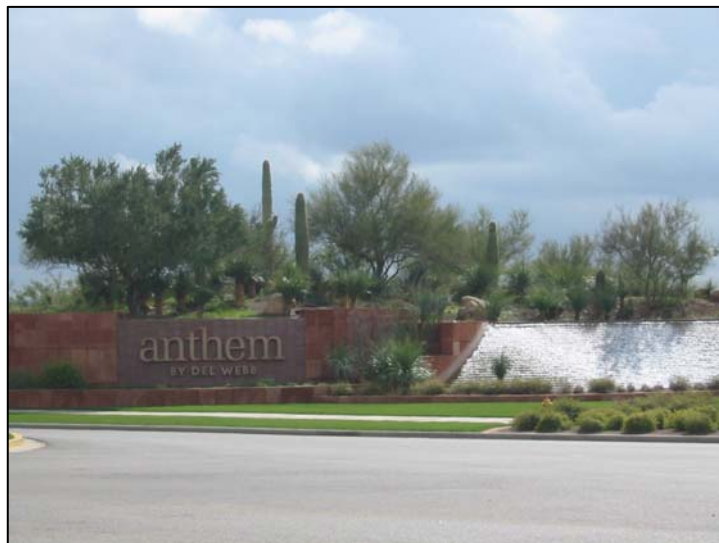
Figure 1 – Anthem, AZ