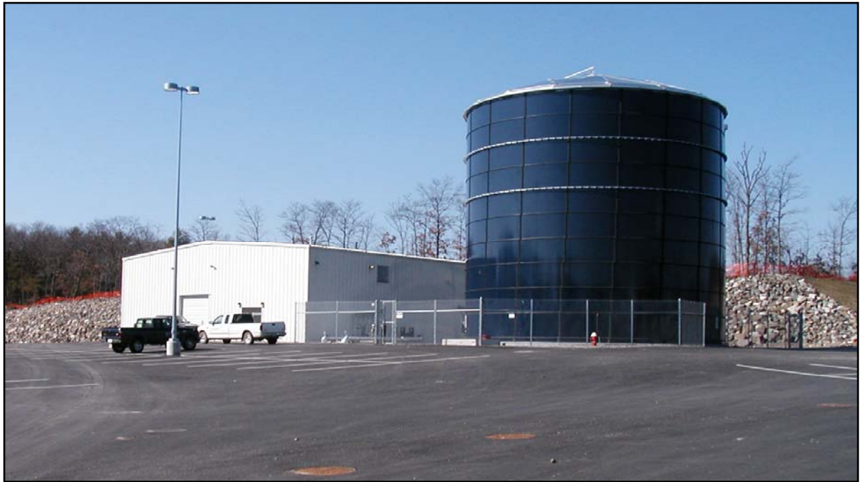
Figure 2 – Gillette Stadium Water Reclamation Facility and Flow Equalization Tank

The system is a closed loop wastewater treatment and recycling facility. Through the use of membrane bio-reactor (MBR) technology and ultra violet treatment the wastewater is treated and disinfected for reuse. In addition the facility is a level 5 treatment facility with nitrogen removal to meet Massachusetts direct reuse standards.