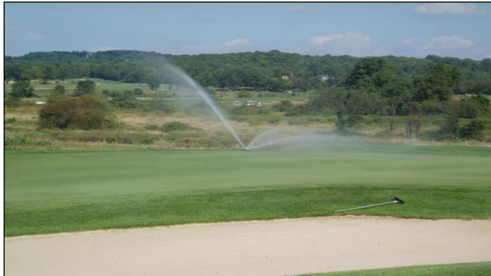
Figure 5 – Golf Course Irrigation

The population served by this system includes 220 residential units, 340,000 square feet of commercial space, and a club house / banquet hall. American Water has operated and maintained this system successfully from its inception in 2004. Please refer to the flow diagram in Figure 6 for more detail of the designed flow and technical makeup of this system.